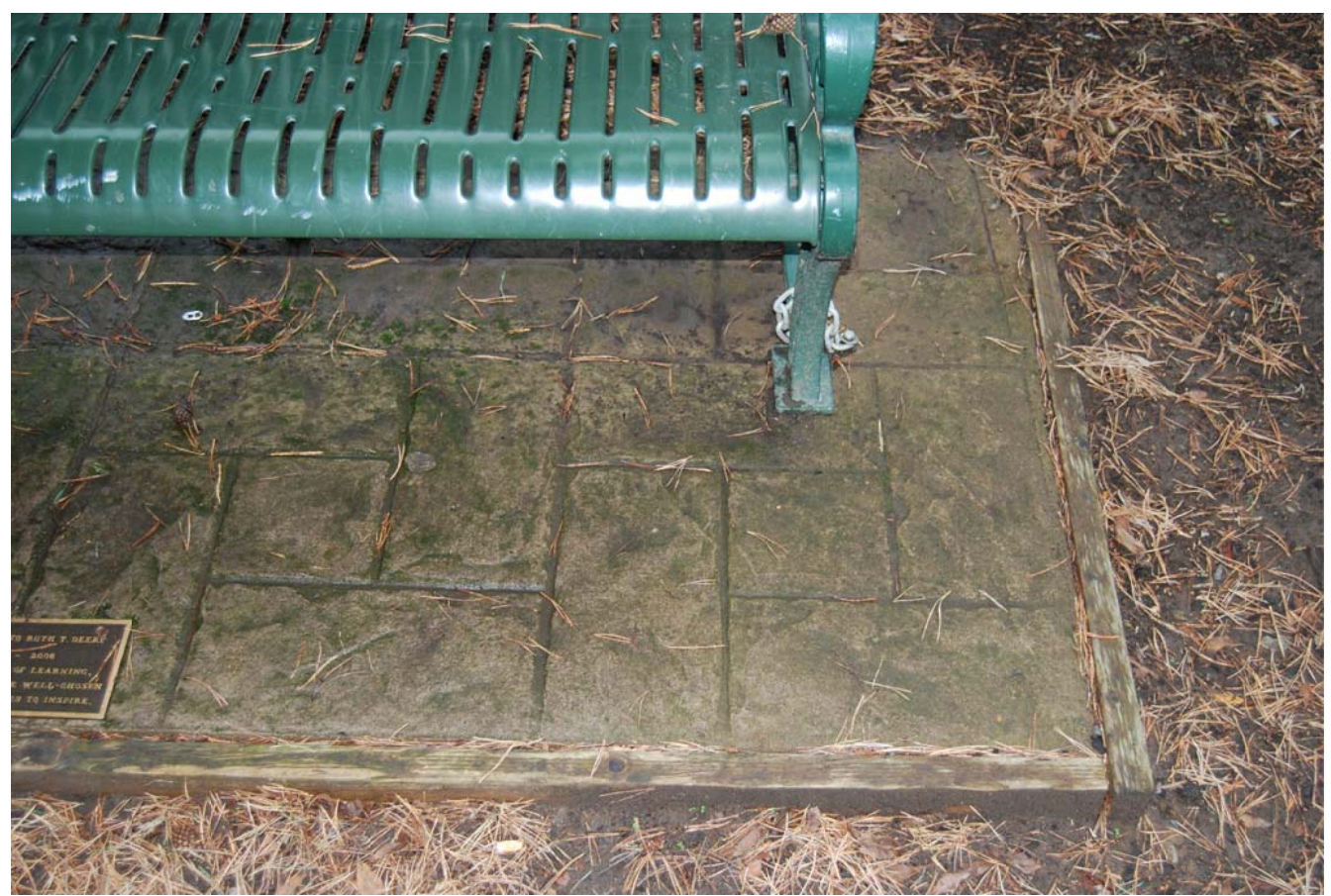
TYPICAL STAMPED, COLORED CONCRETE PATTERN