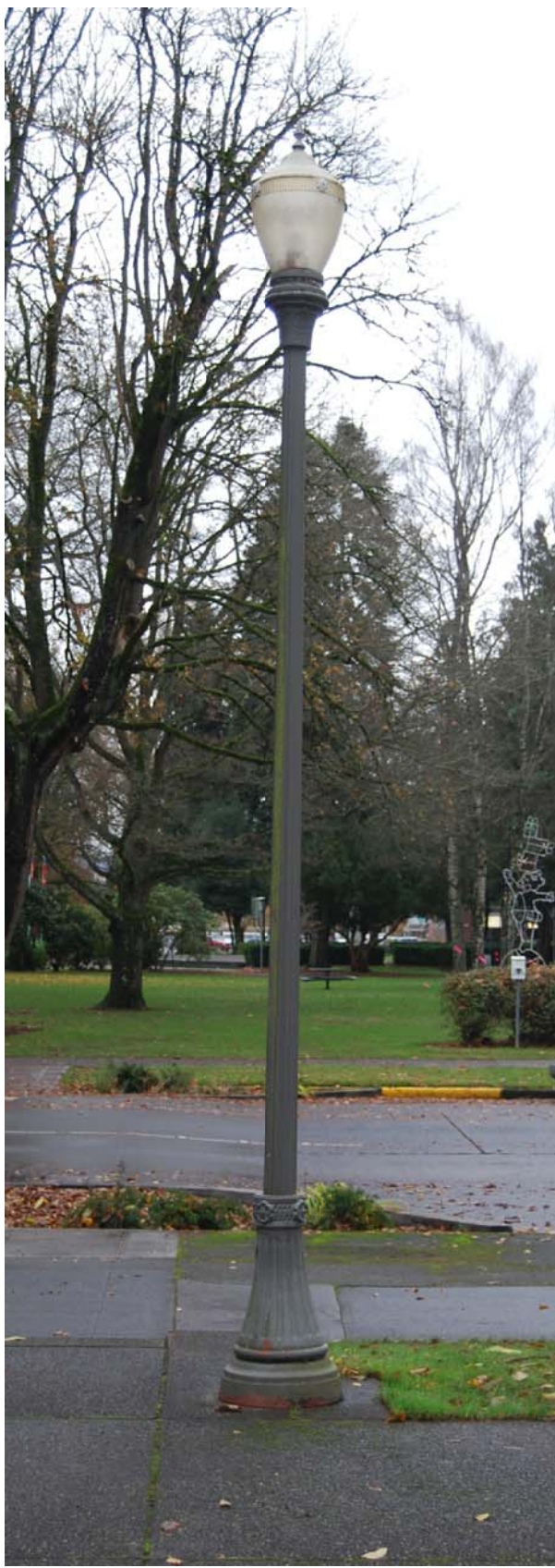
TYPICAL LIGHT POLE