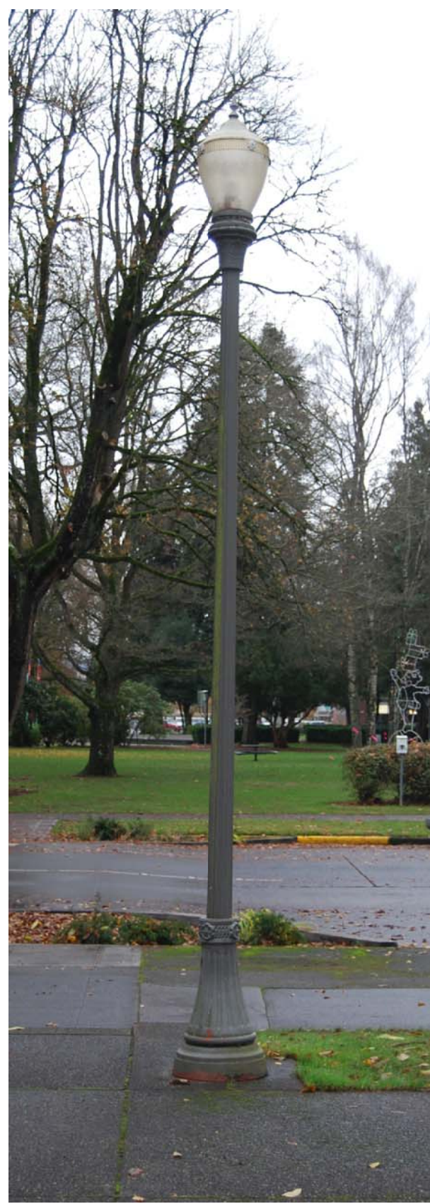
TYPICAL LIGHT POLE