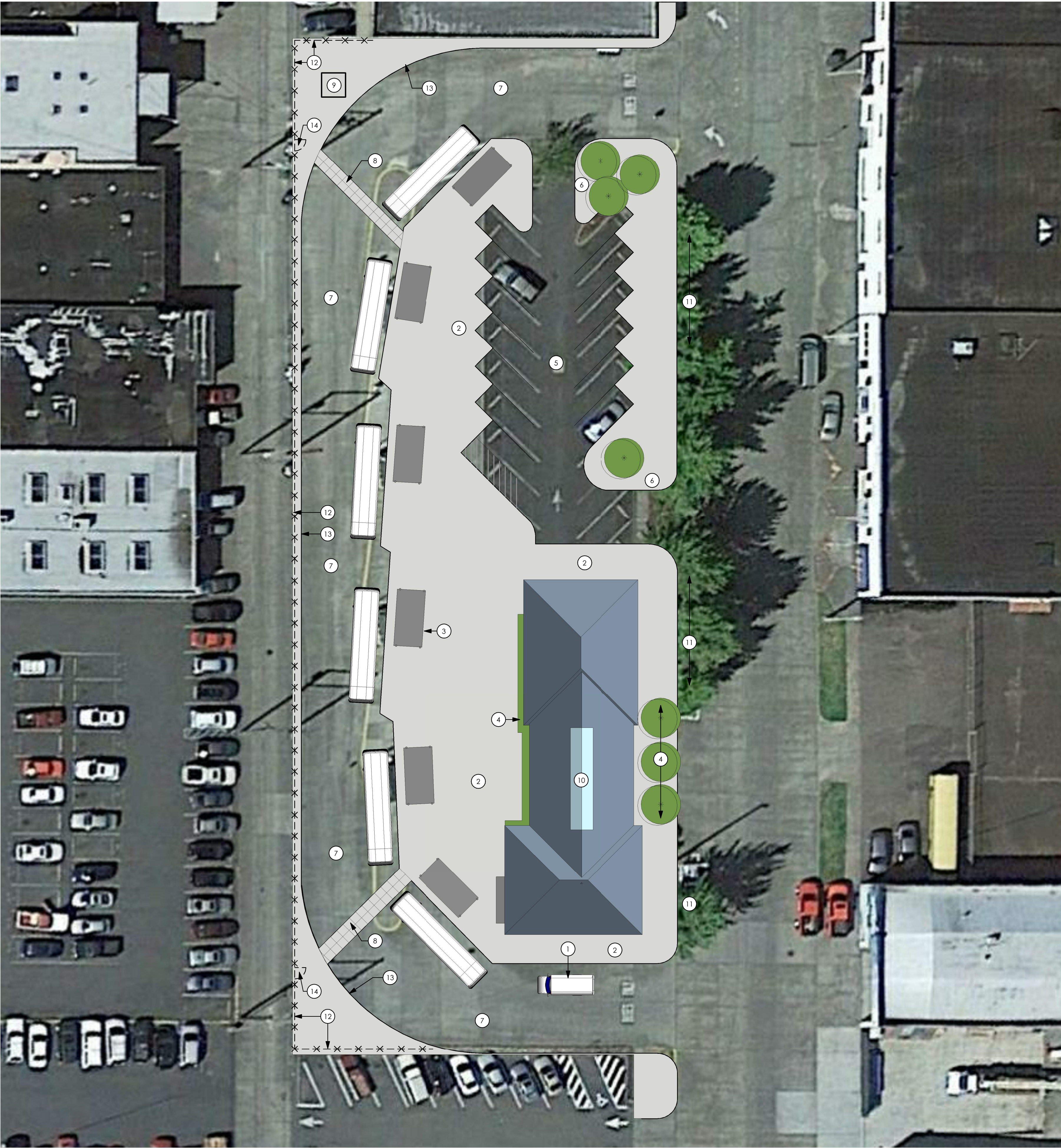
2 SITE PLAN 1" = 20'-0"