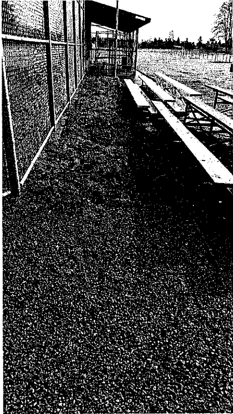
Proposed New Sidewalk Area