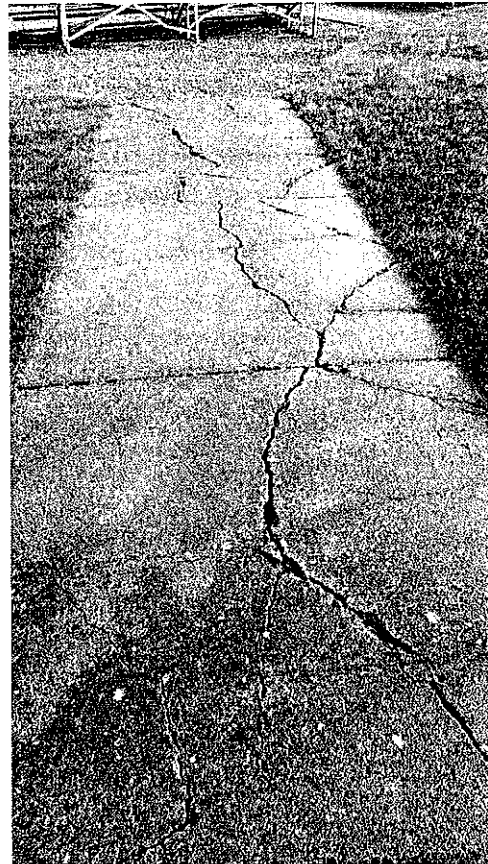
Replace Broken Sidewalk