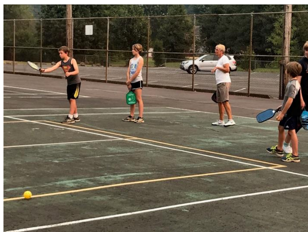
Free Pickleball Lessons