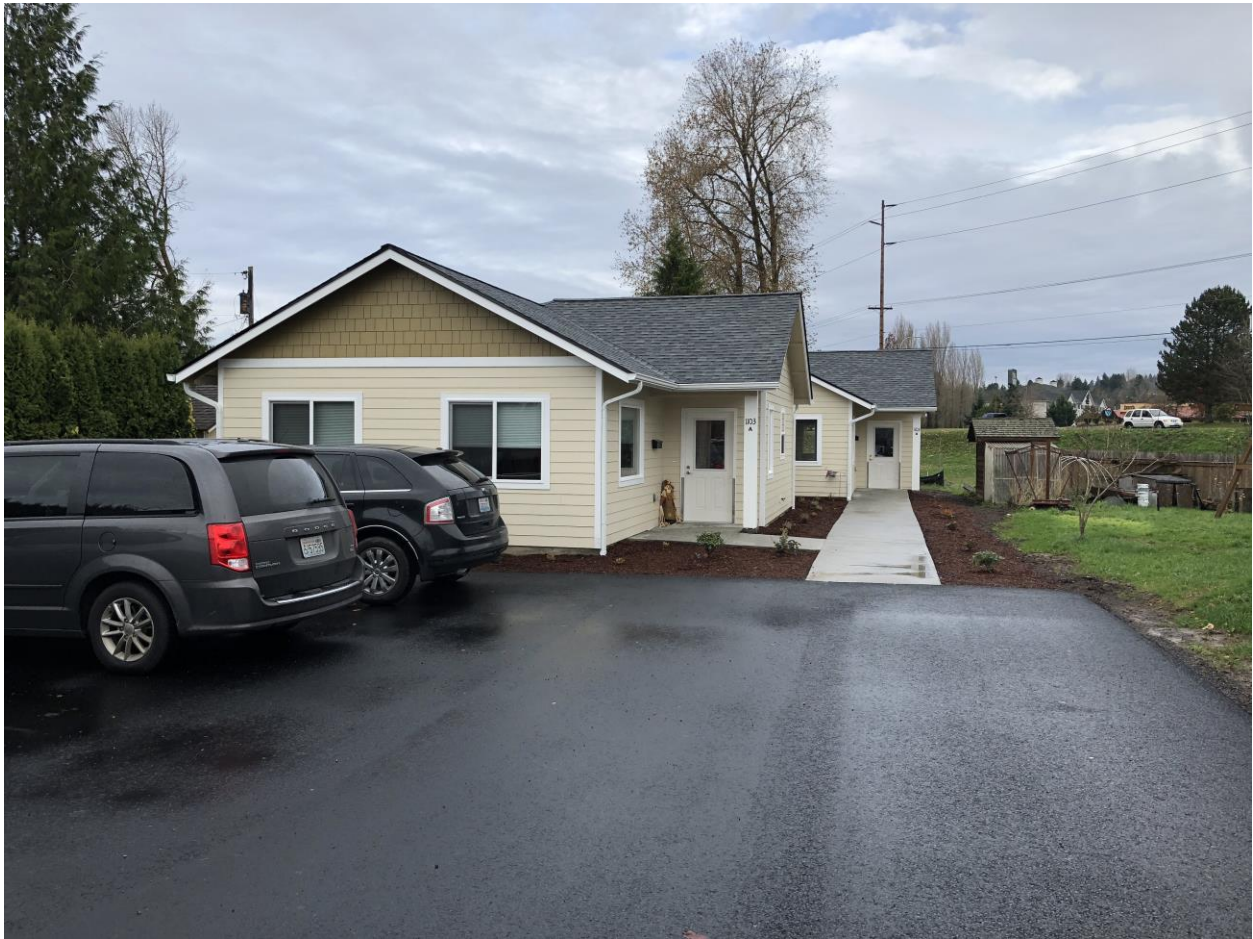
Mill St Group home

Please list those projects that should have been inspected on-site this program year based upon the schedule in §92.504(d). Indicate which of these were inspected and a summary of issues that were detected during the inspection. For those that were not inspected, please indicate the reason and how you will remedy the situation.