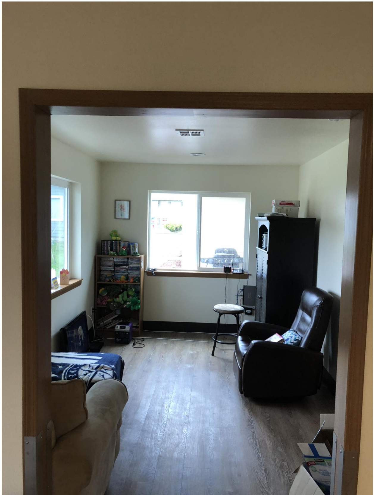
Mill St duplex