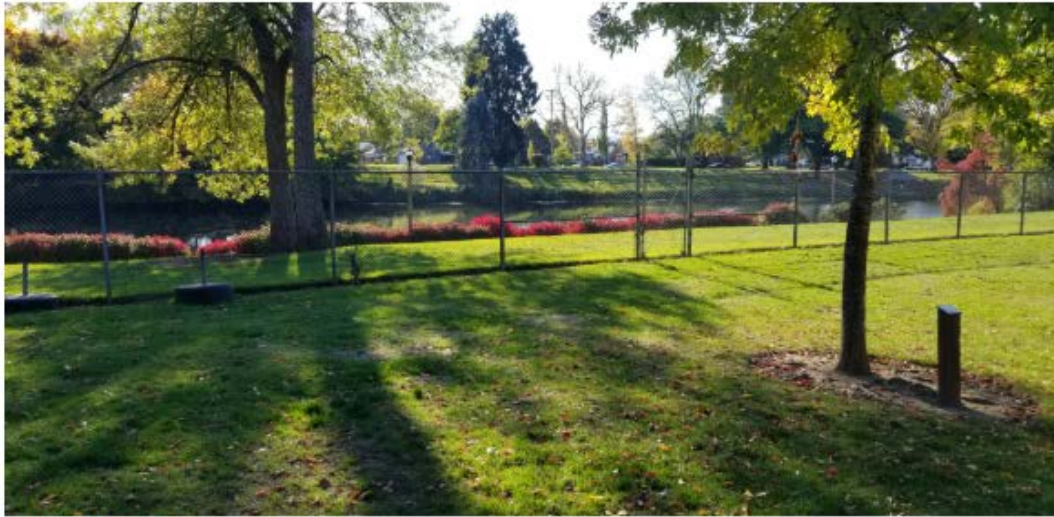
Future Garden Space