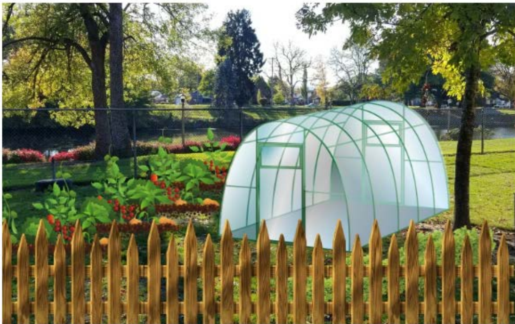
Goals for Future Garden Space

Ultimately, the goal is not only to continue to provide teens at the Teen Center the opportunity to experience the many benefits of gardening, but to establish a Life Skills program, hosting cooking classes with local chefs, workshops with WSU Master Gardeners, and more. Our Teens have indicated one of their favorite programs we've ever put on was a cooking course that was improvised with nothing more than a hot plate. Through these classes, teens will learn important life skills that will empower them to make healthier choices, putting them on the path to happier, healthier lives as they transition into adulthood.